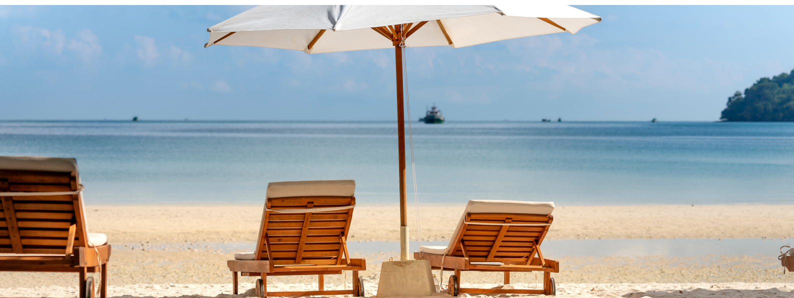
Private Beach with sunbeds and parasols