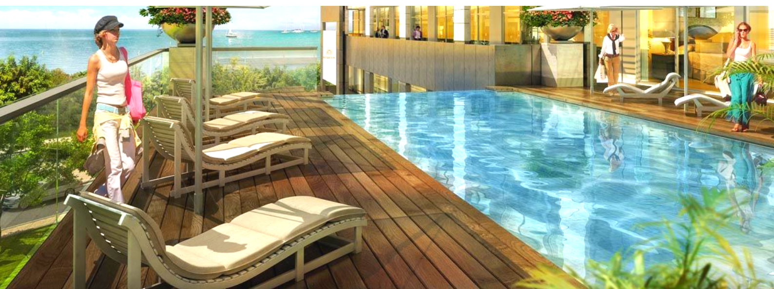
Bali-beds, 3 outdoor pools and one heated indoor pool