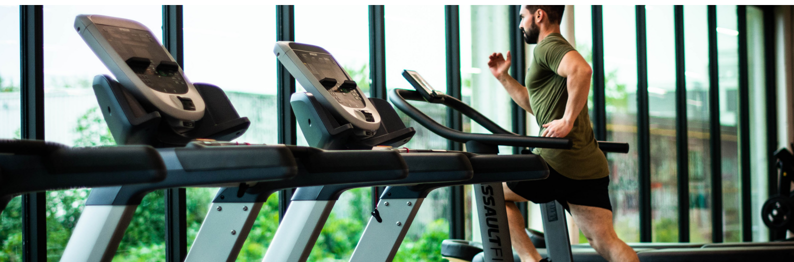
Luxury spa and glass-wall Fitness in the Forest