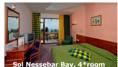
Sol Nessebar Bay, 4* room